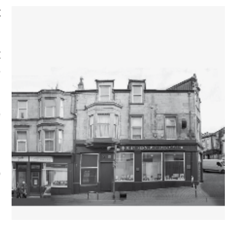
07 - 16 JUNE Castlegate Aberdeen I AB11 5BQ free

Argyll Street, Dunoon is the main street that runs through this Scottish seaside. Shops along Argyll Street have opened and closed in response to the changing fortunes of the town. Today more than ever, small, rural towns are fighting to retain their high streets. Tapping into the stories of people who have managed shops across two centuries, this high-street long exhibition uses shop windows and signage to share the stories of people, enterprise and place.