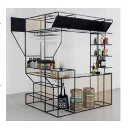
22 JUNE The Old Courtroom Oxford House I 71 Oxford Street Glasgow I G5 9ER

Dress for the Weather enjoy engaging non-architect audiences and propose to enhance the social and civic platform of Architecture Fringe 2019 with the 'Architecture Bar' serving as platform for a Conversation Menu. They'll aim to break down the big ideas behind In Real Life and key exhibitions and projects behind the fringe. But it's hard to come at it cold! Like the waiter in Monty Python's sketch we're offering to 'get people started'.