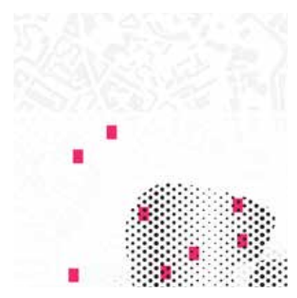
07 - 23 June Secret Locations Glasgow free