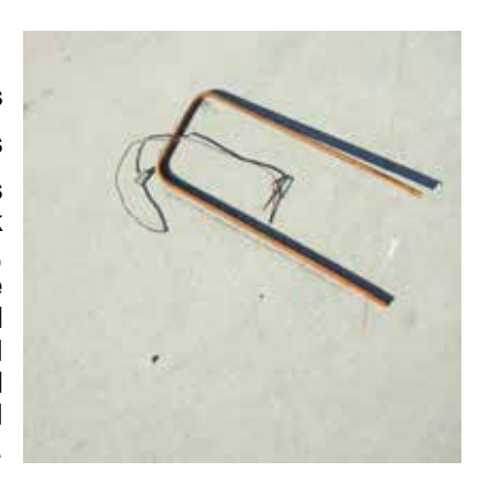
19 June 382 Great Western Road Glasgow I G4 9HT free

Out on site taking the weekly progress photographs Dinda also secretly made a body of work documenting the subtleties of light on concrete, the making-dos of construction workers, and the incidental / accidental collection of forms and shadows made by off-cut, discarded and unused materials. Exhibited for the first time Fass' pared down aesthetic combined with a keen observational eye will let you see a building site through new eyes.