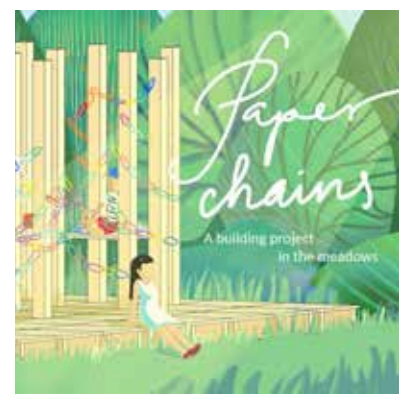
14-16 June 34 Wright's Houses Edinburgh | EH10 4HR